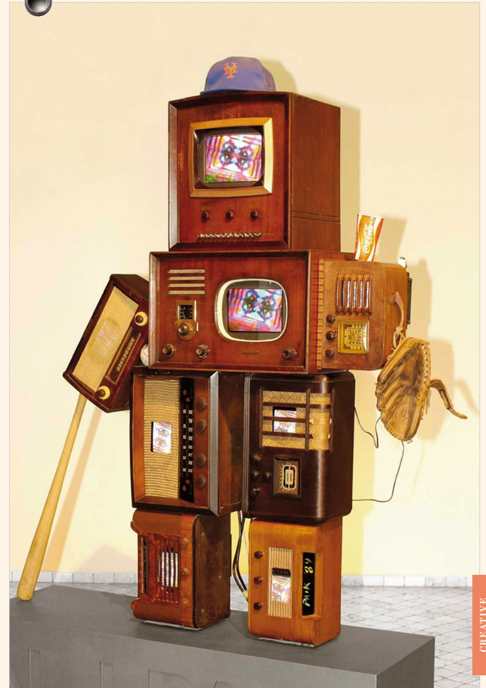
Nam June Paik Robot

: location THE SOURCE Hall 2.1. Urban Superior 2nd floor